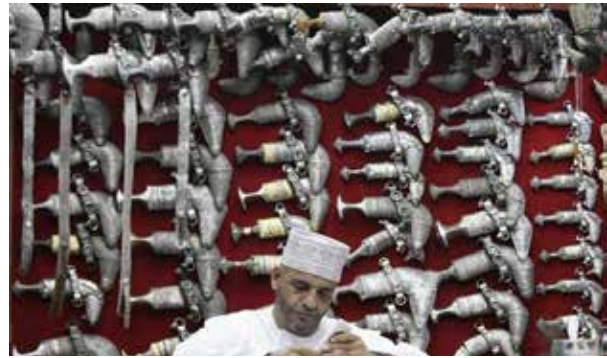
Caving, Omani Souqs (Markets)

The capital of Oman was named Ninth Best City to live and work in the world in by the Arcadis in ‘Social Sustainability Index – 2016’.