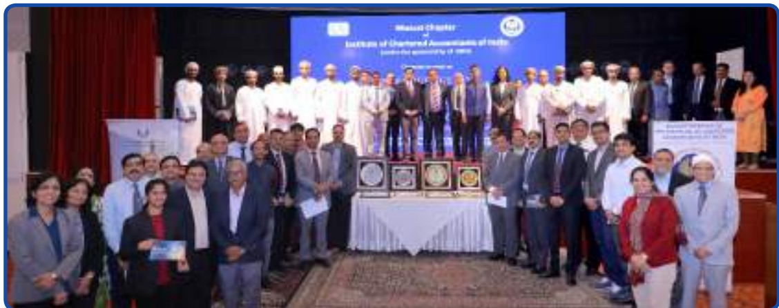
The Muscat Chapter-ICAI award celebrations on 18 th February 2020 at Al Falaj Hotel, Muscat, Sultanate of Oman.