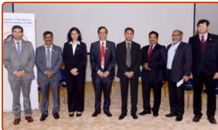
ICAI Muscat Chapter Managing Committee 2020-21